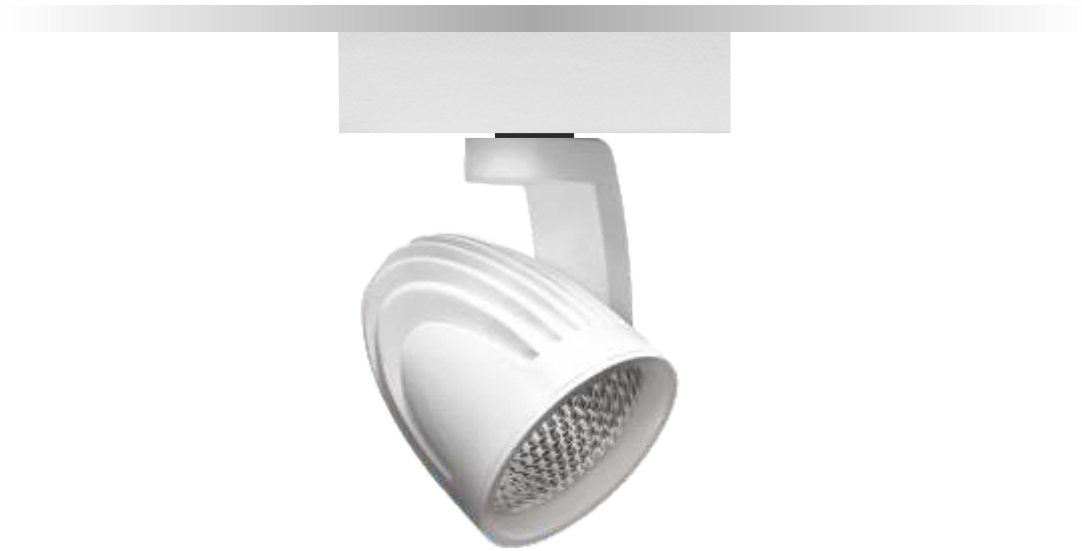
Available Reflector Deg.